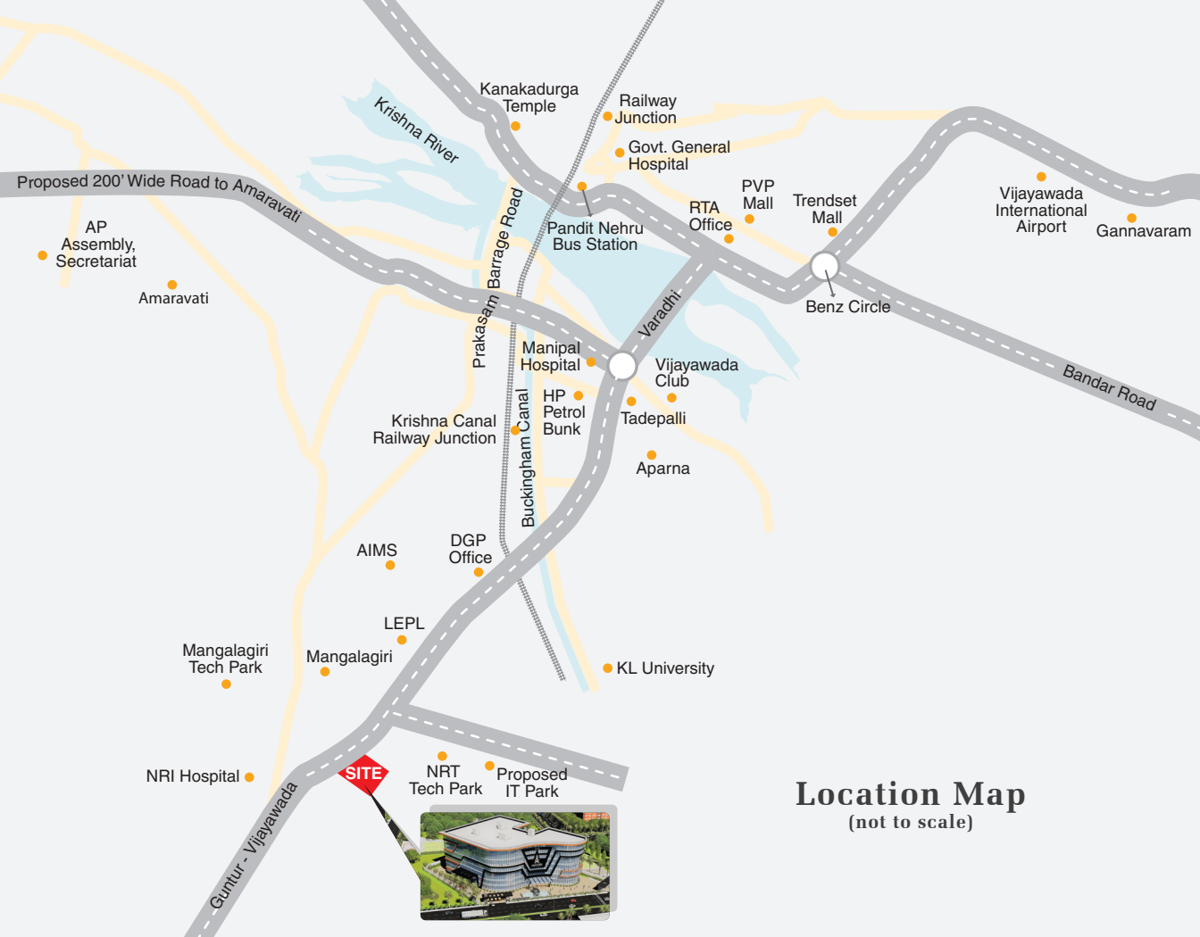
Location Map (not to scale)